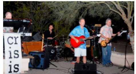
The band "crisis" kept everyone entertained.