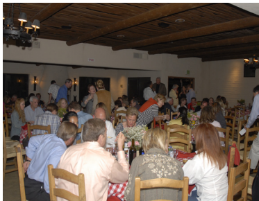
Event attendees enjoying dinner